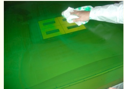
Step 3. Use rags or towels to wipe up ink residue. Re-apply to clean up ink residue in image area.